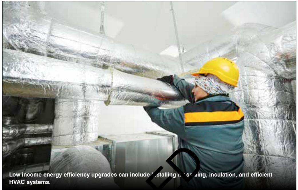
Low income energy efficiency upgrades can include installing air sealing, insulation, and efficient HVAC systems.