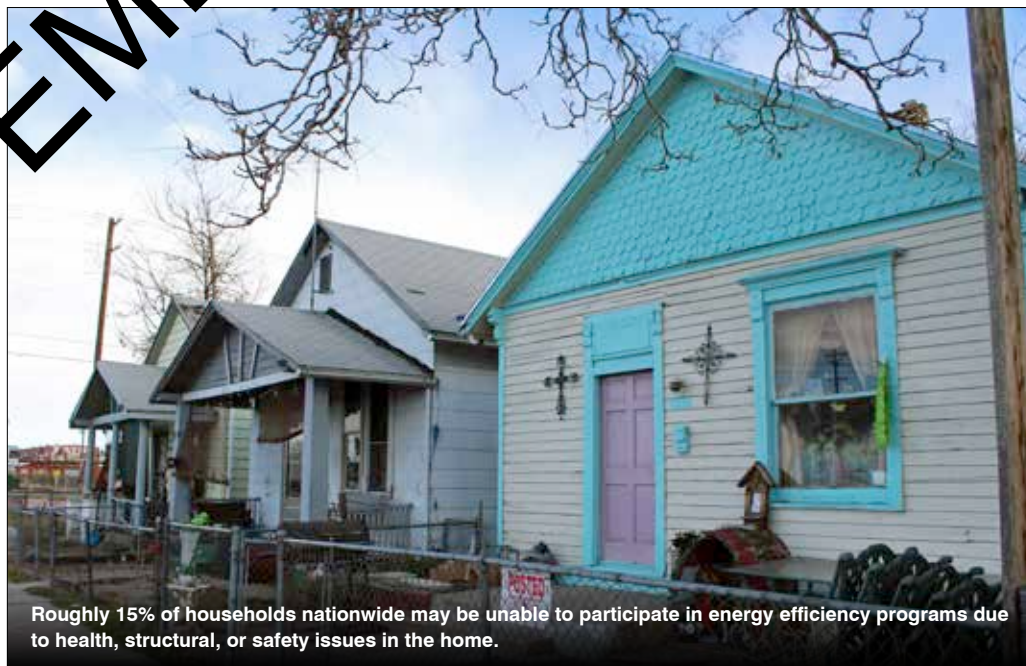
Roughly 15% of households nationwide may be unable to participate in energy efficiency programs due to health, structural, or safety issues in the home.

This report finds that with the right policies in place, states and utilities can make it easier for low-income households to access opportunities to cut their energy use by 20 percent or more, saving hundreds of dollars per year on electricity bills. EDF estimates that achieving this potential would save more than $7.4 billion worth of electricity annually and cut 48 million tons of carbon dioxide each year. That is the equivalent of taking nine million cars off the road every year. 3