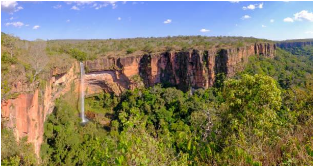
Figure 3: Chapada dos Guimarães, Mato Grosso

In 2017 REM allocated about $54 million to Mato Grosso, from the German Federal Ministry of Economic Cooperation and Development and the British Energy and Industry Strategy, for reductions in deforestation between 2015 – 2019, purchased between 2017 – 2020. The state