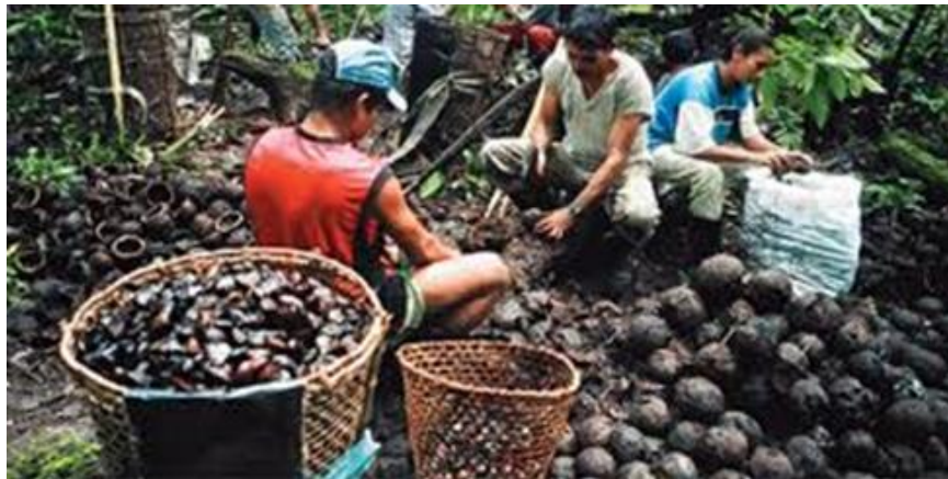
Figure 2: Forest people collecting Brazil nuts

their execution, as well as the actual expenditure of most resources by local communities meant that the Indigenous Subprogram was more participatory than others. But by the same token, the communities relative lack of experience meant delays in project implementation and reporting. Building management capacity in local Indigenous organizations was a principal recommendation of the independent evaluation of phase I of the REM in Acre 6 . The Indigenous subprogram of the REM in Acre focused on implementing Indigenous Territorial Environmental Management Plans, training and supporting Indigenous Agroforestry Agents, and differentiated intercultural Indigenous teacher training.