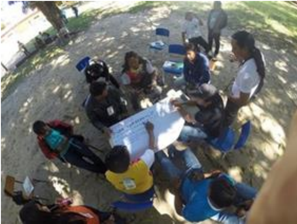
Figure 4: Planning for Indigenous territories subprogram