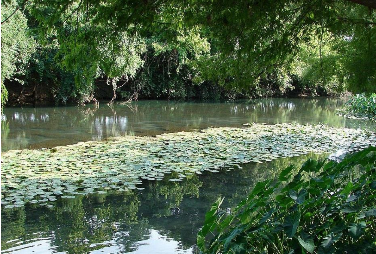
The Comal River starts at Comal Springs, which is fed by the Edwards Aquifer. Trading is utilized in the Edwards Aquifer to secure water, as production from the aquifer has been capped to protect spring flow.