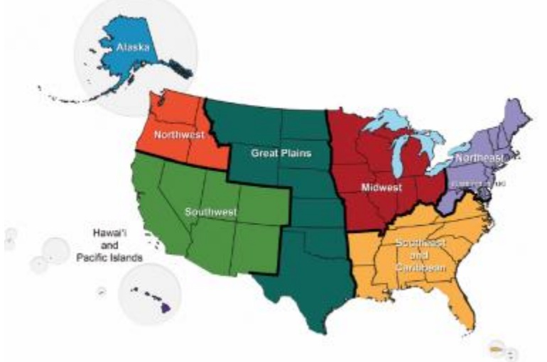
Regions in the Nation Climate Assessment