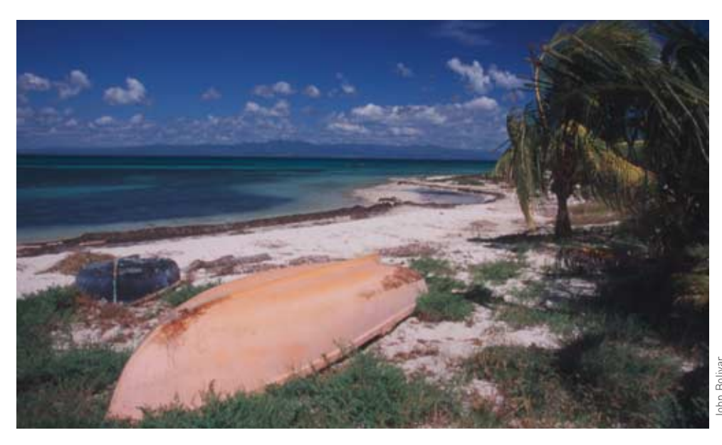
We are helping design marine reserves that could encompass hundreds of square miles.

culprits. In the Philippines, reefs are dynamited for their fish.