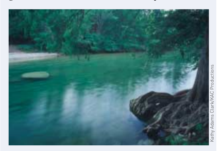
Threatened by unnecessary and unsound water projects?

"If we can make sure some of these bad projects don't get built," said MacLeod, "that will accomplish a lot."