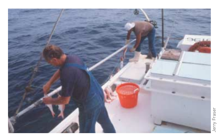
Hauling in red snapper, a fish decimated by the shrimp industry.