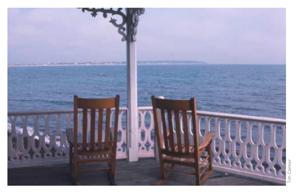
Sea breezes are free, but only a relative few enjoy them. Americans spend $11 billion a year on air-conditioning.

Energy Star measures and labels the energy efficiency of products ranging from air-conditioners and refrigerators to computers. U.S. EPA 6202J, 1200 Pennsylvania Avenue NW, Washington, DC 20004; 888-STAR-YES (888-782-7937).