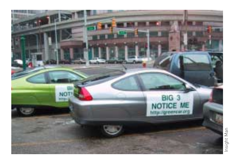
Serving notice to Detroit: Clean cars are here to stay.