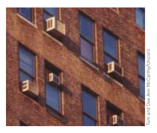
Get the best from your box. AC needn't be wasteful and expensive.

A University of Michigan study estimates the average family could reduce home energy bills 65% by maximizing efficiency. Strategically planted deciduous trees provide shade in summer and let in light in winter. Shading your AC's intake lets the unit work less by drawing cooler air. New homes can incorporate a passive solar design with protruding eaves to keep out the high summer sun.