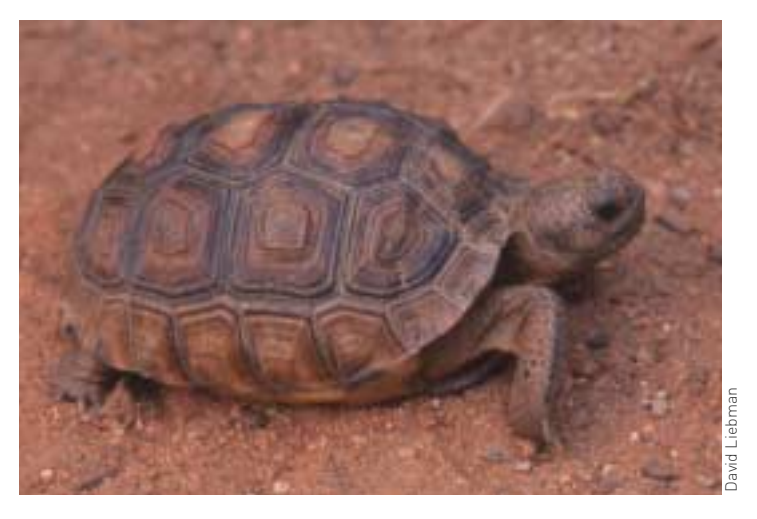
A keystone species: Gopher tortoises' burrows may shelter up to 360 other species, large and small.