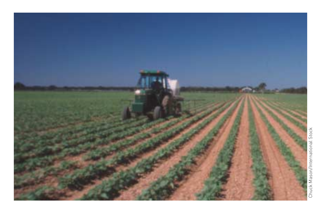
The science is clear: Nitrogen runoff from Midwestern farms is the main cause of a massive "dead zone" in the Gulf of Mexico.