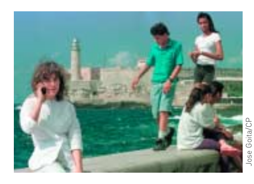
Cuba's easy coexistence with the sea may soon be ending.