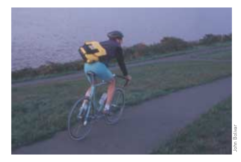
Biking to work is good for the soul—and for the planet as well.