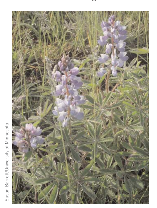
Wild lupine (Lupinus perennis)

Demand for CRP monies regularly exceeds available funding, and the Farm