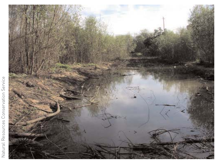
Site of the Partners in Restoration pilot program, Elkhorn Slough is one of California's last remaining coastal marshes. The 44,000-acre watershed is located in Monterey and San Benito counties and encompasses varied habitats, including tidal marsh, mixed oak woodlands and strawberry fields.

-Sarah Beth Lardie Development and Communications Director Sustainable Conservation