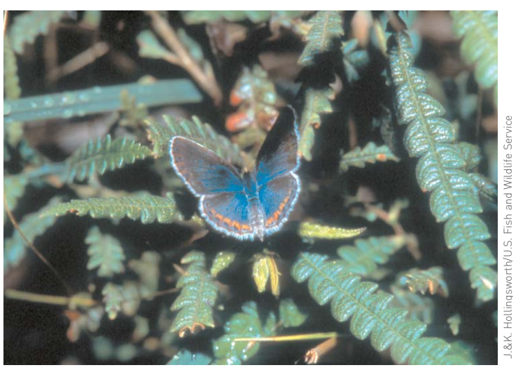
In the last quarter-century, the endangered Karner blue butterfly has declined by 90%. Loss of dry prairie, pine and oak barrens, oak savannah and other prairie habitat is the primary cause for its disappearance.

The Karner blue butterfly seed mix is now available to landowners in 13 counties of Wisconsin, where native habitats (e.g., oak and pine barrens and oak savannah) and the Karner blue once were part of the landscape. Though