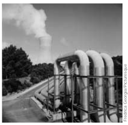
Cogeneration—reusing energy generated in industry—is a clean renewable electricity source.

New Jersey residents will soon have the power to choose cleaner electric companies. Governor Whitman has signed the state legislature's energy-restructuring bill, which also strengthens the state's commitment to energy efficiency and renewable energy. Pub-