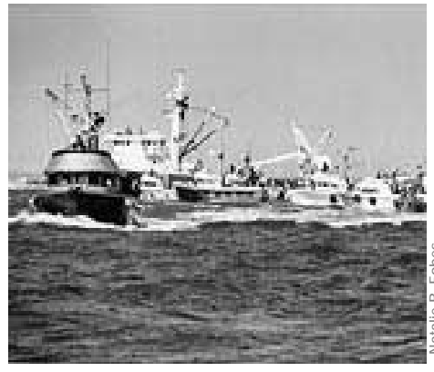
Shortening fishing seasons to reduce catch can lead to highly competitive, unsafe fishing "derbies" with too many boats fishing long hours to maximize their catch.

By contrast, traditional methods of limiting catch—such as shortening the fishing