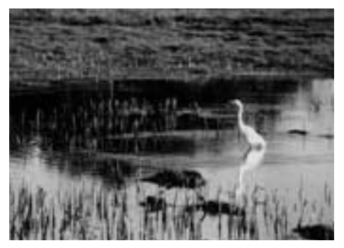
Wetland habitats like this one in the San Francisco Bay Delta would be harmed by the current plan.

EDF and a broad coalition of conservation, fishing, and urban groups successfully blocked a last-minute agreement between the U.S. Department of the Interior and outgoing California Governor Pete Wilson that would have continued the legacy of publicly subsidized dam-building, damage to fisheries and habitat, and inefficient use