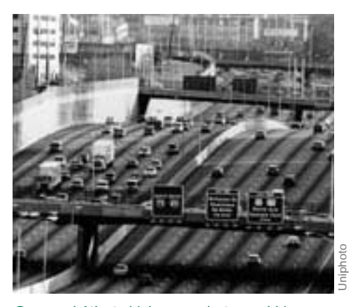
Proposed Atlanta highway projects would increase pollution and congestion, and harm low-income communities.

"Atlanta is a front line in the national struggle for clean air and transportation civil rights," said EDF Federal transportation director Michael Replogle. "These agencies