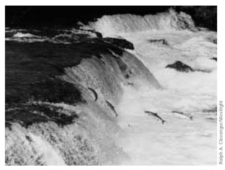
The restoration of forests along riverbanks in Oregon and Washington should help to rebuild dwindling runs of once-plentiful salmon.

"Coastal coho salmon should benefit directly from these programs because they do not need to navigate huge Columbia River dams between the ocean and spawning