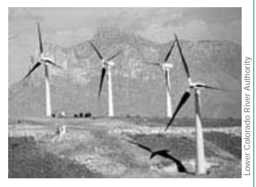
Wind power is popular with Texans.

Last year, a "deliberative poll" of Texas energy customers discussed the benefits and costs of various energy alternatives, including coal, gas, wind, solar, hydroelectric, and biomass fuels. Utilities found overwhelming support for renewable energy and energy