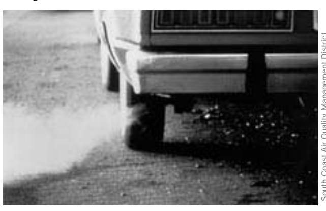
Low-sulfur gas and new technology can mean cleaner Western air.

of smog-forming pollutants and more than 11,000 tons of fine particulate matter that threatens human health and scenic vistas.