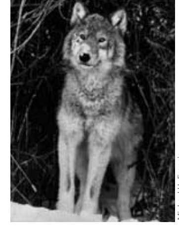
Gray wolves are expanding their range in the Western Great Lakes

In South Dakota, years after disappearing from the state, black-footed ferrets are once again doing well. Captive-bred ferrets were released there in 1994, and the population is now multigenerational, with the young of released ferrets giving rise to yet another generation. Bald eagles are also returning to South Dakota, where no pairs were found in 1990. In 1997, eight pairs occupied territories in the state.