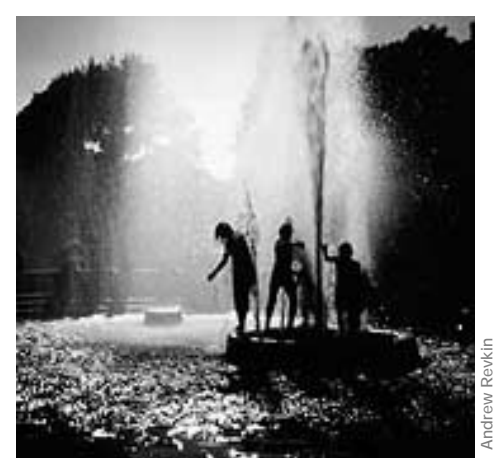
Children cool off in a fountain in New York City, where about 13 days a year are above 90°. By the year 2100, 32 days a year could be that hot.

The President's budget includes $200 million for a "clean air partnership fund" to help states and localities reduce emissions of greenhouse gases and other pollutants from automobiles and coal-fired power plants. It provides $1.4 billion for research and devel-