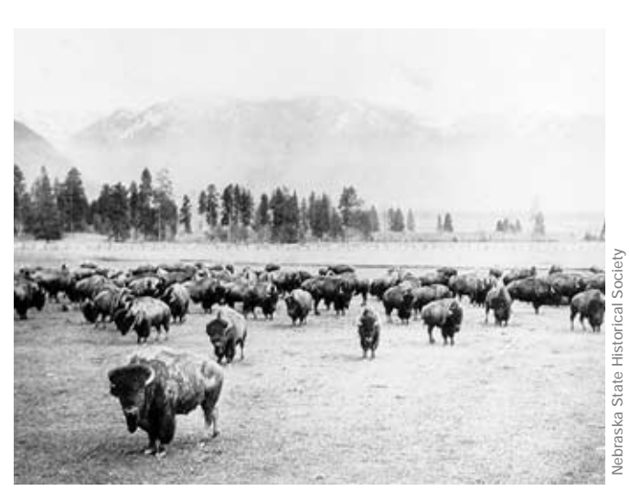
Unconstrained hunting effectively wiped out once-plentiful buffalo herds in the wild, although a few thousand animals remain in protected areas.

Stories of landowners' deliberate actions to keep endangered species off their land prompted the Fish and Wildlife Service to initiate a "safe harbor" policy in 1995. Under this policy, which EDF helped to develop, landowners who agree to restore or enhance the habitats of endangered species on their property—something they are not required to do by law—can receive permission to develop that land at a later date, even if it becomes inhabited by an endangered species. One hopes, of course, that