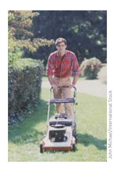
Mowing the lawn with a gas mower produces as much pollution in half an hour as driving a car 172 miles.

Minimize watering (brown is the natural color of grass in late summer)