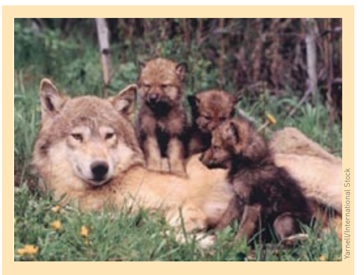
Gray wolves, denizens of Yellowstone until exterminated by humans in the 20th century, have been reintroduced to the park.