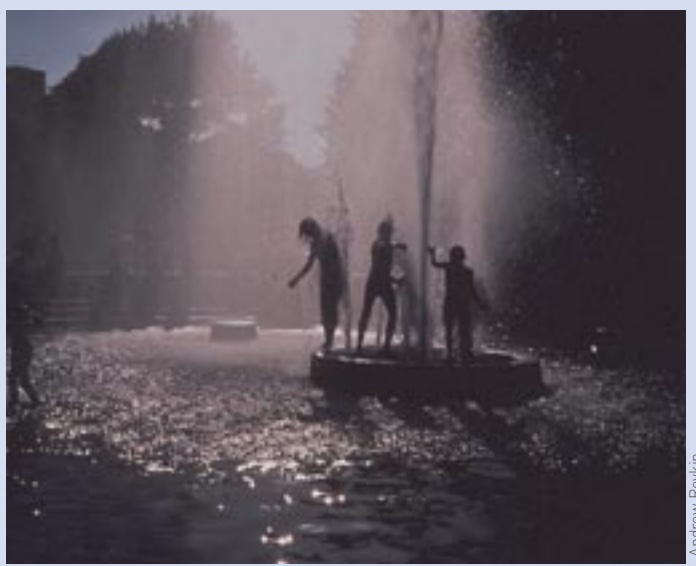
Will this summer bring yet another heat wave?

Earth Day 2000 will involve thousands of events, from rallies and teach-outs to concerts and earth fairs. To volunteer, or to find the fun on April 22, visit www.earthday.net. If you're in Washington, DC, don't miss the Environmental Defense booth on the Mall.