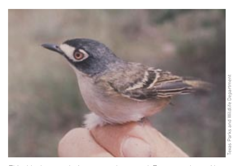
This black-capped vireo once threatened Texas ranchers. Now major landowners are enlisting in our species recovery project.