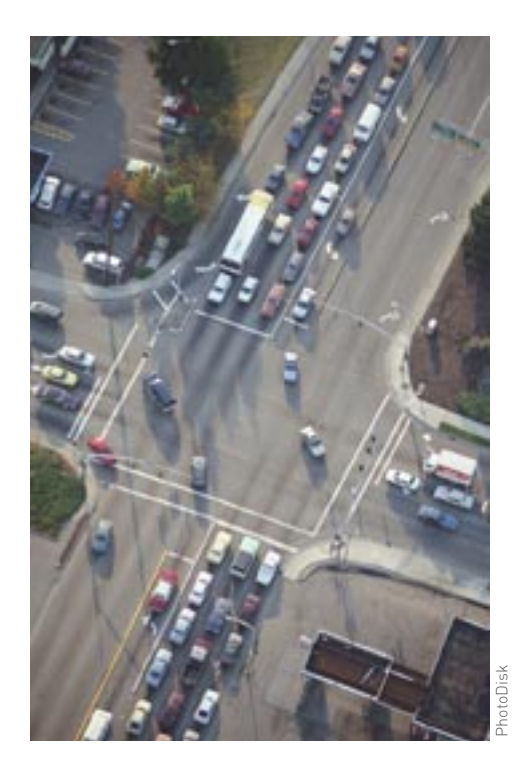
Urban zones that fail to meet new clean air standards could lose highway funding and face federally imposed clean-up programs.

In another victory, stemming from a lawsuit brought by Environmental Defense and others, EPA announced a settlement requiring some of the nation's most heavily polluted metropolitan areas, including Houston, New York, and Chicago, to submit tougher clean-air plans to reduce urban smog.