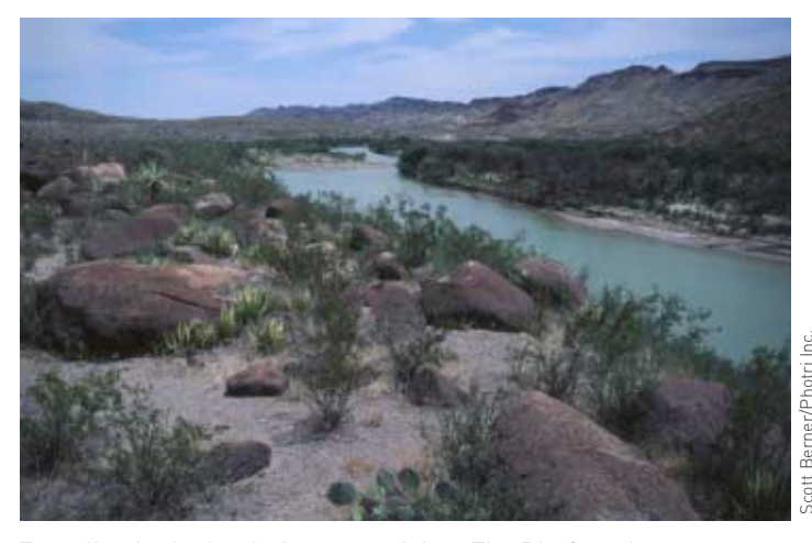
Front line in the battle for water rights: The Rio Grande.