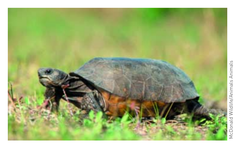
Walk on the wild side: New habitat means new hope for threatened gopher tortoises.