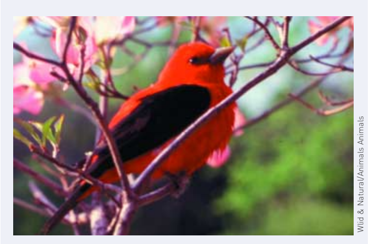
Why not put the Army Corps to good use? Scarlet tanagers urgently require rebuilding the Louisiana coastline.

Together with the Coalition to Restore Coastal Louisiana and government agencies, Environmental Defense is helping frame an ambitious plan to preserve the Mississippi Delta. The $14 billion project will recreate more natural conditions by diverting sediment back into the marshes. If authorized by Congress, this will ensure that critical stopover habitat continues to greet migrating birds for generations to come.