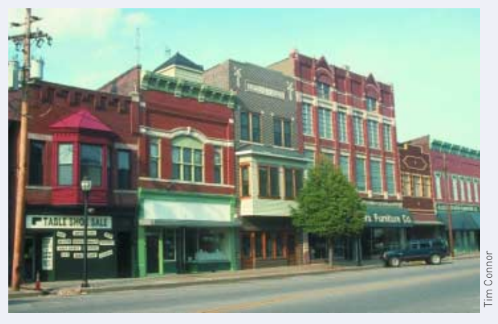
Anytown USA: What toxic substances are in your community?

Find out what's polluting your hometown at: www.scorecard.org.