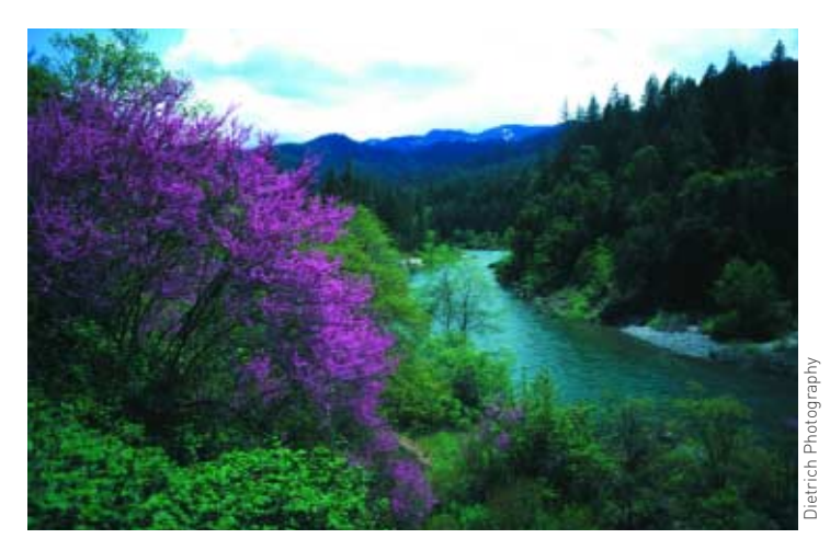
We are working with the Hoopa Valley tribe on the Trinity River.