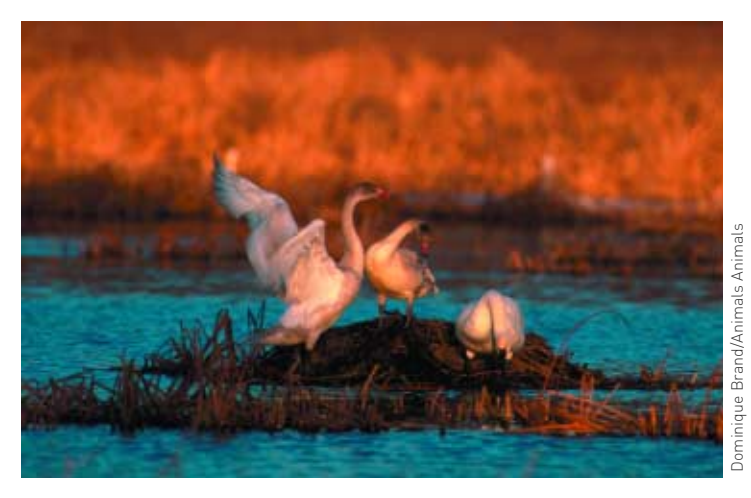
Each year, migrating tundra swans find less food on the Mississippi.