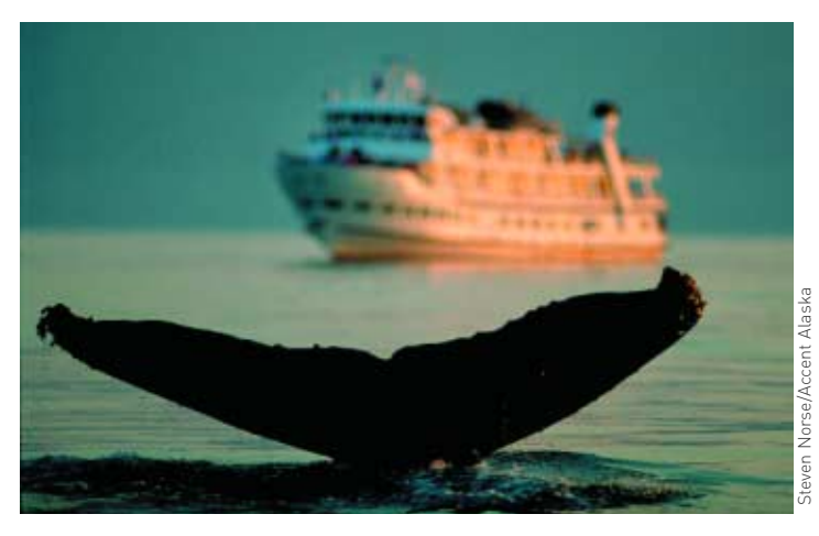
Each year at Stellwagen, 1.5 million people marvel at whales.