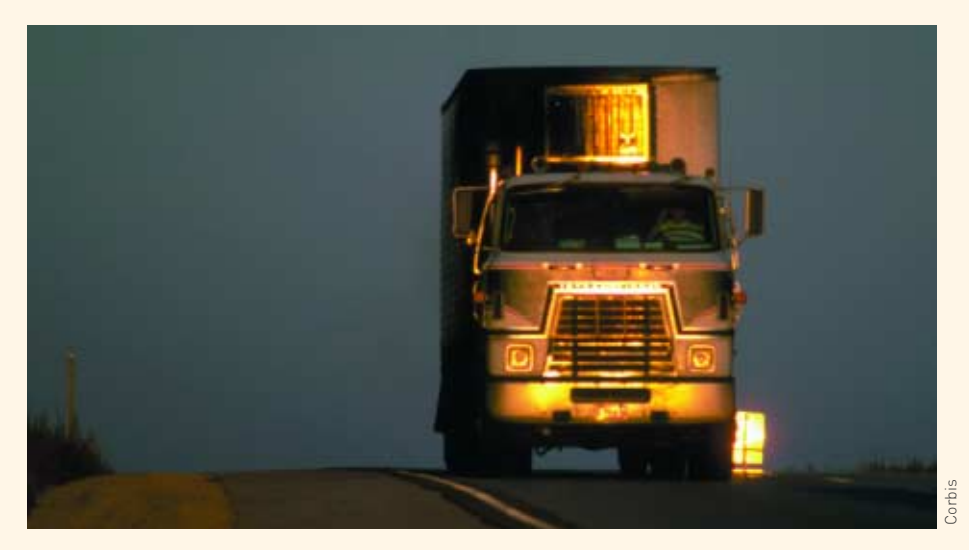
While cars have become cleaner, diesel trucks have had a free ride. We're working to change that in Washington, in the courts, and on the assembly line.