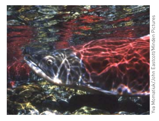
Chefs believe wild salmon tastes better than the farmed variety.

Alaskan wild salmon—the most common variety available—are plentiful. That's why they're a "best choice" on our Seafood Selector , while farmed salmon are a "worst choice." For the complete best/worst list and our Seafood Selector guide, visit www.environmentaldefense.org/sustainablefishing.