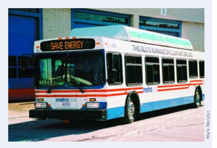
Our Action Network helped win the day for cleaner buses in DC.

On the national level, Environmental Defense recently helped create a unique alliance of government, industry and environmental organizations aiming to make commuter choice benefits available in every workplace.