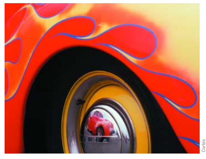
California rules! Once again, the state sets the trend for stricter limits on pollution from vehicles.

In all, 25 states have enacted or are considering greenhouse gas legislation. "By themselves, the states won't solve global warming," says Krupp, "but they're putting the heat on Washington."