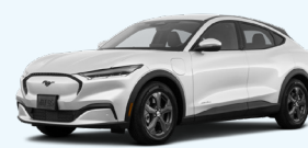
▶ Ford Mustang Mach-E