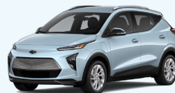
▶ Chevy Bolt EUV