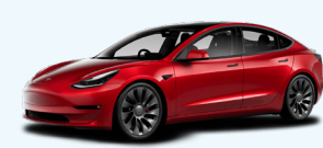
▶ Tesla Model 3

▶ There are also used EV models that will save Wisconsinites money.