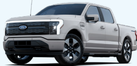
▶ Ford F-150 Lightning