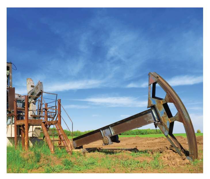
Top Ten Pennsylvania Counties, by Well Count

When a well is left unplugged, it can leak oil and other toxic chemicals, endanger water wells, contribute to air pollution and emit methane - a powerful greenhouse gas. Orphan wells also significantly impact local communities and economies by threatening the health and well-being of residents and decreasing property values - which lowers funding for local schools, police departments, and other public services.