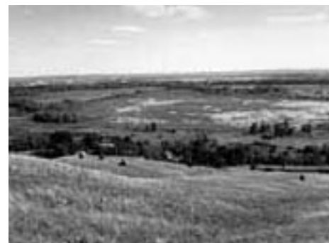
Friends of the Minnesota Valley

ers replant forests and restore wetlands and will extend temporary Federal agreements into permanent conservation commitments for most of the restored lands.