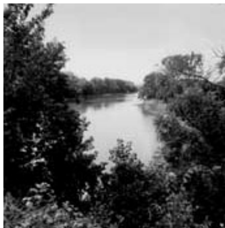
Friends of the Minnesota Valley