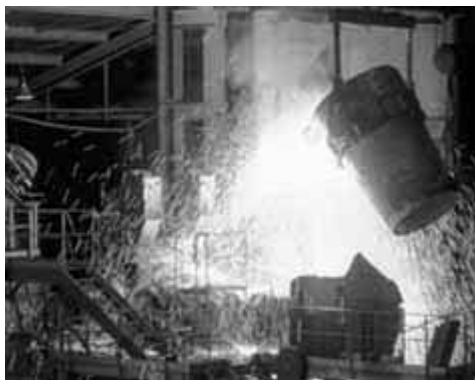
A new study of pollution from steel mills shows significant room for improvement.

www.edf.org/communityguides , along with descriptions of mill processes and strategies for preventing pollution. "With just a few mouse-clicks on EDF's Iron and Steel Com-