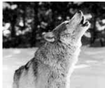
Gray wolf populations in the northern Midwest have increased dramatically in recent years.