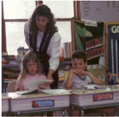
Pollution affects children more than most adults, so it is particularly serious in schools.

September is back-to-school month for most of our nation's children, an appropriate time to think about how parents, teachers, and school boards can make schools safer and healthier. Between the ages of 5 and 18, a youngster may spend 14,000 hours inside school buildings. All too often, research has shown, kids (and the adults who teach them) can be exposed to more