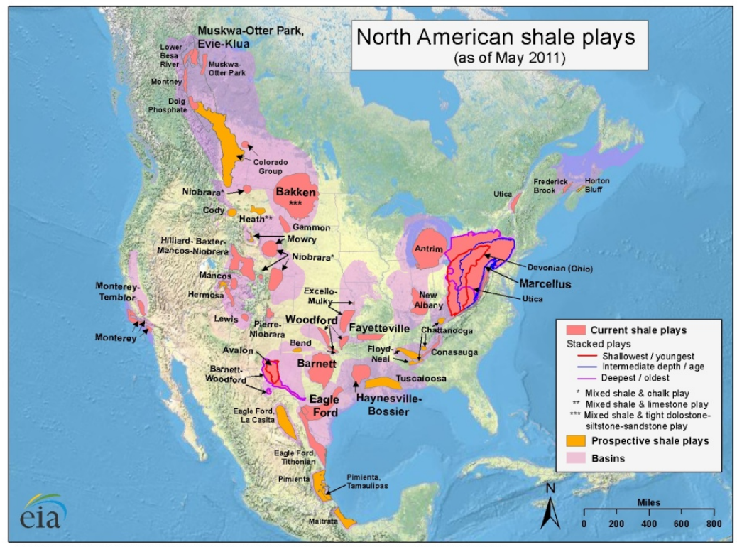
Updated: May 9, 2011

Domestic production of shale gas also has the potential over time to reduce dependence on imported oil for the United States. International shale gas production will increase the diversity of supply for other nations. Both these developments offer important national security benefits.<sup>2</sup>