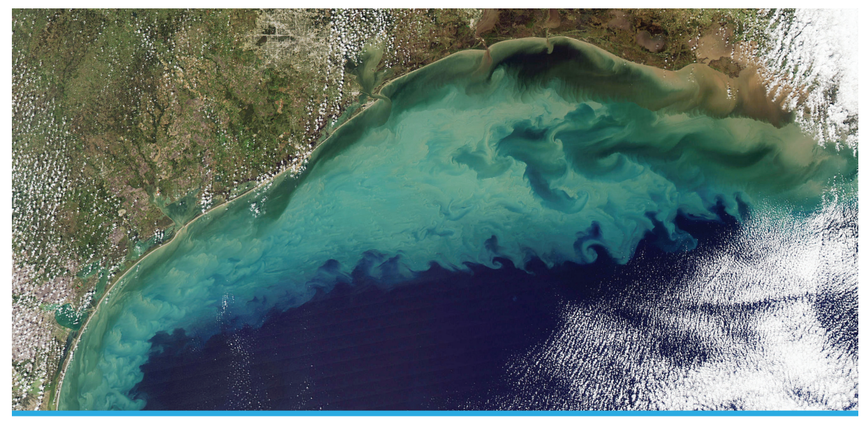
EDF's new "nitrogen balance" tool is helping farmers fine-tune their fertilizer use to reduce runoff and shrink the Gulf of Mexico dead zone, which in 2019 was the eighth largest ever recorded.