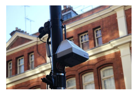
AQMesh pod installed on a lamppost with mains power supply.

The time and resources to obtain permissions to install monitors should not be underestimated. Local knowledge and political buy-in, as well as access to ideal siting locations such as lampposts with mains power supply (including the correct sockets), can streamline this process. Depending on location, installation may require outside contractors, increasing the budget and creating time constraints.