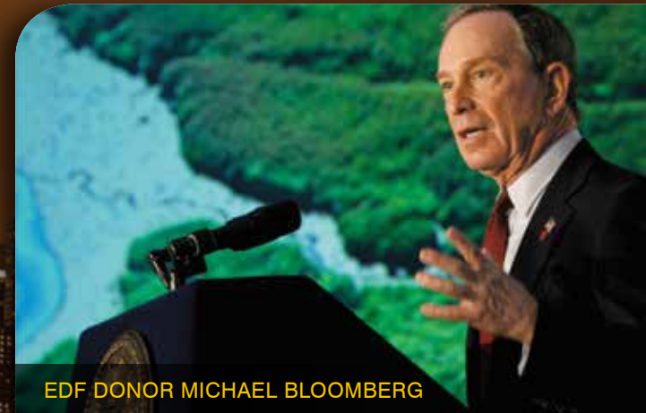
EDF DONOR MICHAEL BLOOMBERG