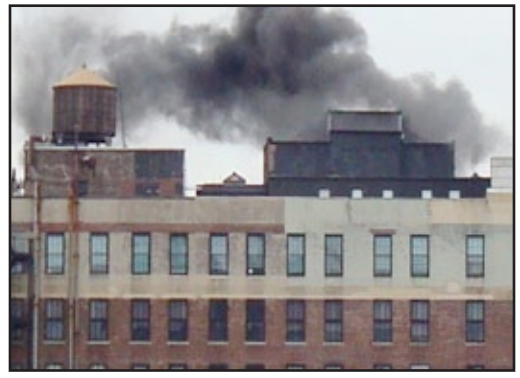
Soot from a building burning No. 6 oil

More than 9,000 big buildings in New York still burn the lowest possible grade heating oil.