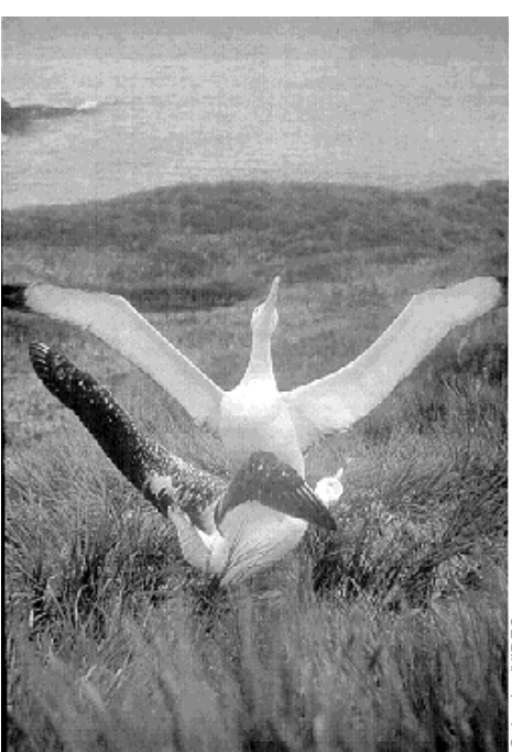
Wandering Albatrosses shown in courtship display. These birds can live as long as humans and they mate for life, raising just one chick every other year.

Implementing these solutions on countless ships of many nations in international waters is a daunting legal and diplomatic challenge. EDF and Defenders of Wildlife recently coordinated a coalition of a dozen other American and foreign environmental organizations in undertaking this task. They submitted a motion on seabird bycatch to the International Union for the Conservation of Nature (IUCN). The motion will become a key piece of international policy in favor of the birds if the members of IUCN vote for it at a meeting in October in Montreal. This policy will raise the profile of this important issue among governmental bodies and non-governmental organizations, and, more importantly, it will help make longline fishing