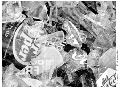
Fact: The use of recovered glass, metal, plastic, and paper by manufacturers has grown steadily since 1985.

Recycling is not a panacea for our environmental problems, to be pursued at any cost or to the point of diminished returns. Yet there is compelling evidence that, by