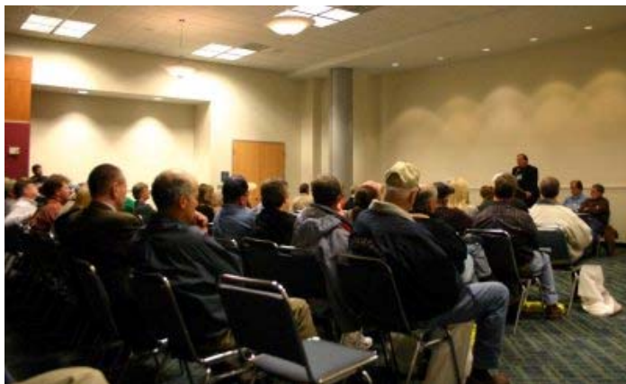
Maryland Watermen hear from a panel of fishermen from the Gulf of Mexico, Alaska, New England and other regions who fish under alternative management systems.

EDF worked with Maryland watermen leaders who graciously volunteered to serve as hosts and help guide each session. During each session, discussions mostly focused on how alternative management can be designed to meet particular fishermen goals such as avoiding consolidation of shares and ensuring opportunities for new entrants. Often repeated concerns included the need to: (1) build a more trusting relationship with DNR Fisheries Service; (2) consider the complexities of the blue crab fishery and market; (3) increase coordination throughout the entire Chesapeake Bay; (4) encourage access, fairness and equality; (5) address issues like water pollution and