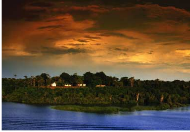
Indigenous people are the best defenders of their Amazon home.

The last large tract of pristine Amazon forest could soon be protected, thanks to our partnership with grassroots groups and government agencies that are building a mosaic of reserves in Brazil's Terra do Meio, the "Middle Lands." Located between two large complexes of indigenous lands, the new reserve will complete a 96,000square-mile corridor of exceptional biodiversity, sheltering endangered spider monkeys, giant river otters and the forest itself, highly vulnerable at its edges