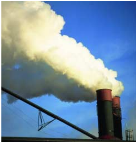
Second-hand smoke: Pollution can drift for hundreds of miles.

To see how a stronger standard would help your state, visit www.environmentaldefense.org/go/blowingsmoke.