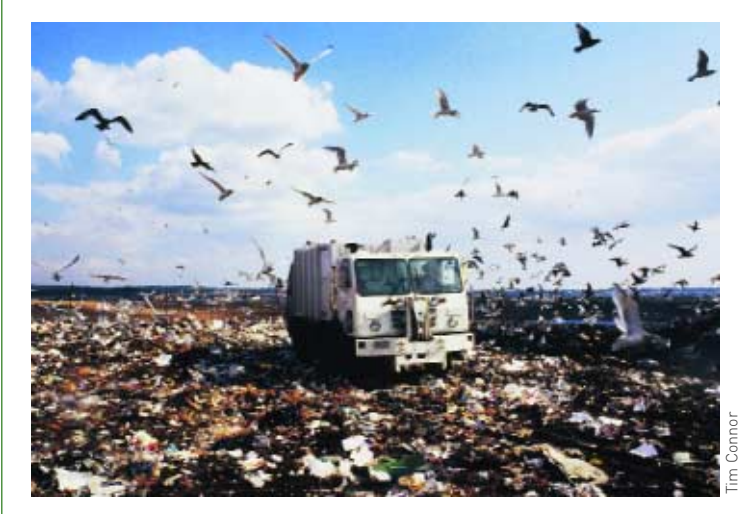
Loud, smelly garbage trucks will travel 50% less under our plan.

Imagine a sleek building that blends with the Manhattan waterfront park surrounding it. It features a rooftop community garden, solar panels, even an on-site wetland. A nature education center perhaps? Surprisingly, it's a garbage transfer