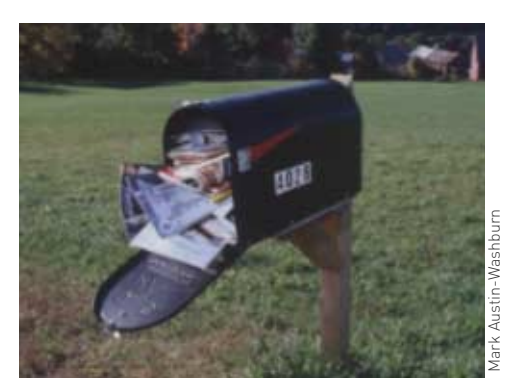
Overstuffed: 58 catalogs each year for every man, woman and child.

Though recycled paper is competitively priced and looks as good as virgin paper, there's almost none in your holiday mail. Instead, the 17 billion catalogs shipped in the U.S. each year devour forests, using enough wood to build a six-foot high fence around the Earth seven times. Of manufacturing industries,