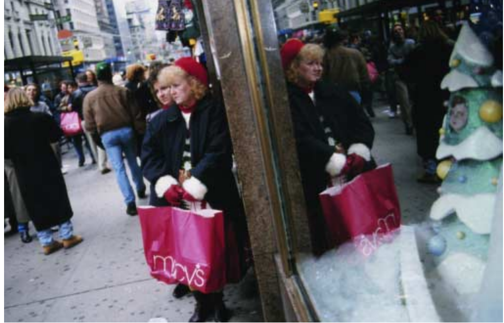
Holiday shopping need not be a drag...for you or the environment.

Green tags: Green tags are available through such national suppliers as: Community Energy (150 Strafford Avenue, Suite 110, Wayne, PA 19087; 866-WIND-123; www.newwindenergy.com) and Bonneville Environmental Foundation (133 SW 2nd Avenue, Suite 410, Portland, OR 97204; 503-248-1905; www.greentagsusa.org)