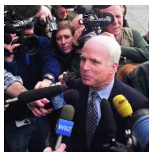
With Kyoto coming into force, John McCain says it's time for the U.S. to do its share.

across-the-board it would have to switch back to dirty coal. We urged the European Union to pursue Kyoto negotiations in the broader context of trade and energy security. That brought the breakthrough: an understanding that Russia could keep gas cheap for its citizens if it gradually increased prices for industry to match the export price. The European