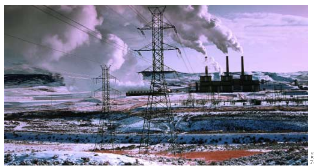
A heartland power plant; As the U.S. balks, industrialized nations develop cleaner technology.