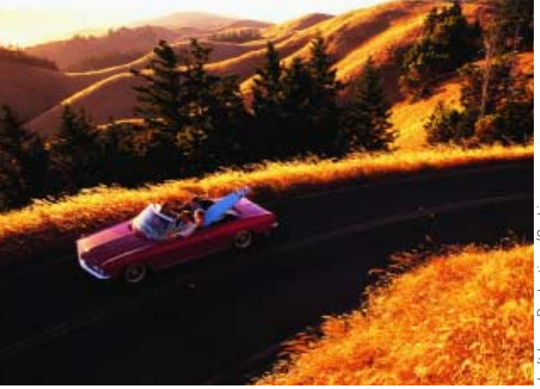
Once again the Golden State is setting the standard.

We are gearing up to help defend the rule, which the industry has vowed to fight. Governor Schwarzenegger also pledged to fend off legal attacks.