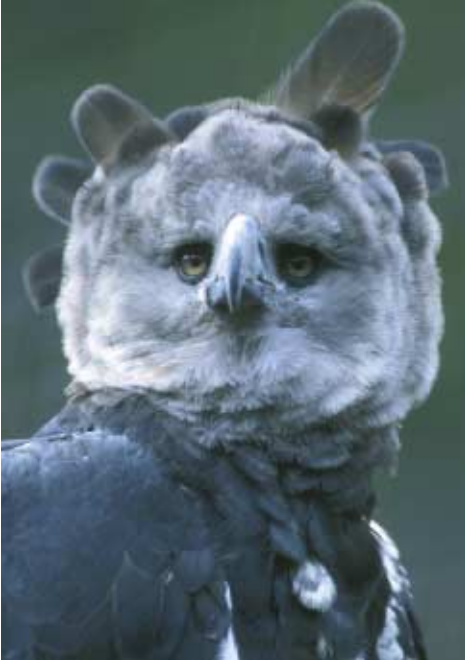
Habitat fragmentation has endangered the rare harpy eagle, the world's most powerful raptor.

Brazil contains one-third of the planet's rain forests and one-fifth of the world's species, but deforestation has placed it among the world's biggest global warming polluters. Now 20% of the Amazon is in reserves, which protect indigenous peoples and wildlife while guarding against deforestation. "With an increasing expanse of tropical forest in reserves worldwide," says Schwartzman, "the protection of a substantial proportion of the world's remaining biodiversity is possible."