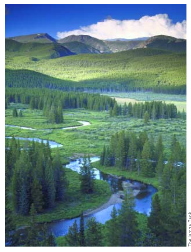
Will our children enjoy the Rocky Mountain National Park we know today? We teamed up with Trout Unlimited to safeguard the park's future.

state and EPA and find ways to reduce pollution before lasting damage is done."