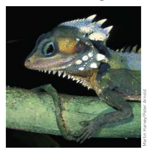
Tiny candidate for oblivion? Boyd's forest dragon could lose its rainforest home.

What do Boyd's forest dragons in Australia and smokey pocket gophers in Mexico have in common? Both could face extinction by 2050 if humans don't rein in global warming. These conclusions come from a first-ever global