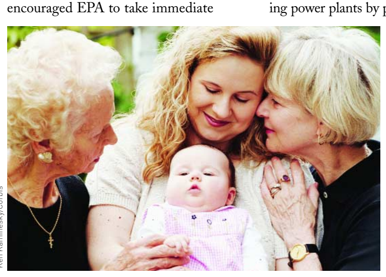
A family affair: Asthma in children has jumped 160% in two decades, a nationwide epidemic. Asthma attacks can be triggered by air pollution.

In a step toward cleaner air, the U.S. Environmental Protection Agency unveiled a plan in December that would reduce smog- and soot-generating emissions from power plants across the East. The move follows two years of advocacy by Environmental Defense, in which we encouraged EPA to take immediate