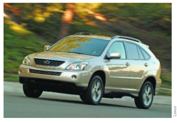
More hybrids will be hitting the streets, including the first luxury model, this soon-to-be-released Lexus.

with groups in Connecticut to introduce a clean car bill this session. "Momentum is building," says Baird. "States are sending a powerful message to Washington that people want cleaner vehicles."