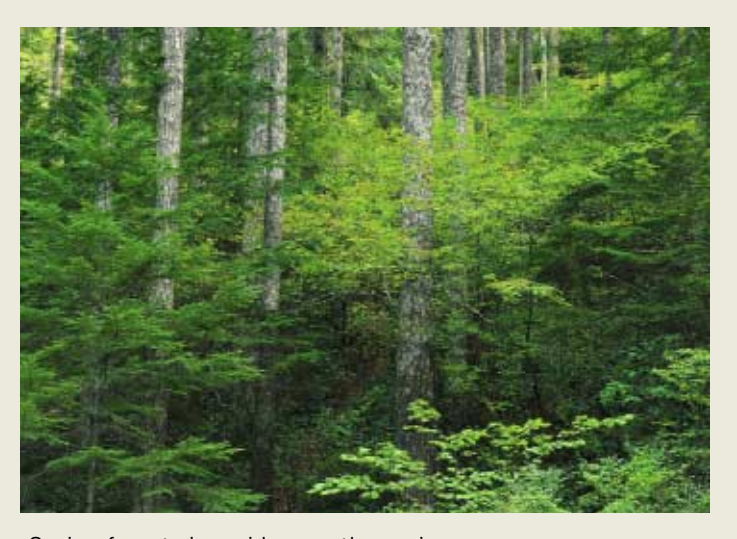
Saving forests is an idea worth copying

Write Transportation Secretary Norman Mineta and demand higher mileage standards for all cars and trucks. Visit www.environmentaldefense.org/action or send a letter to the U.S. DOT, 400 7th Street, S.W., Washington, DC 20590.