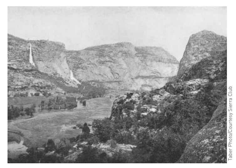
The way it was: Support is building to drain the reservoir that in 1913 drowned Yosemite's majestic twin valley.