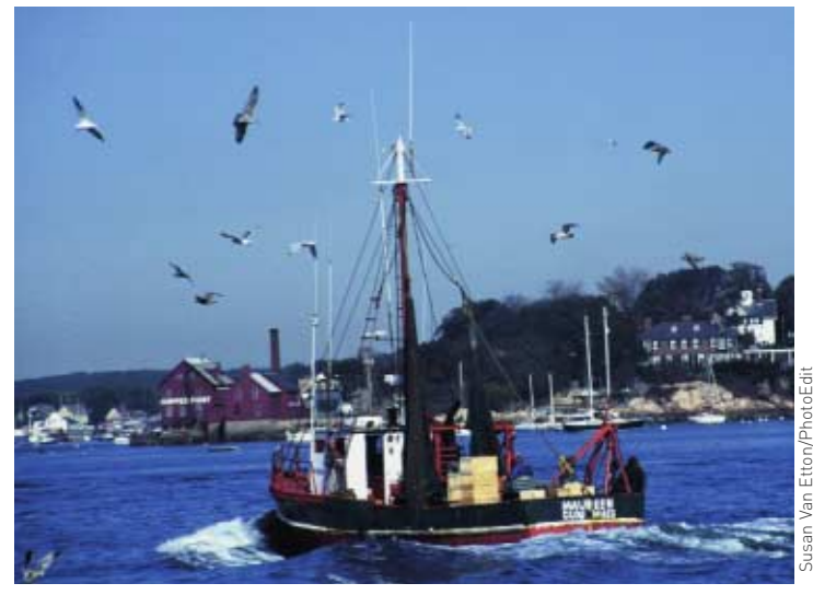
If plans to revive one of the nation's most troubled fisheries are successful, boats will ply New England waters for generations to come.

In New England, federal regulators have tried to control the amount of fishing by restricting the number of days at sea, rather than the amount of fish