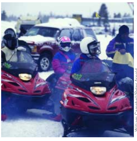
A typical snowmobile emits as much pollution as 100 cars.

"This study makes clear that, as our climate changes, the parks and preserves that currently harbor imperiled species may no longer be able to do so," says Environmental Defense attorney Michael Bean. "So we must encourage conservation outside these refuges. And we must address global warming."