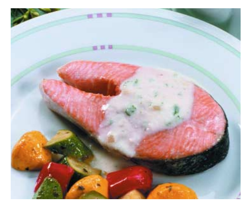
Farmed or wild? It makes a difference.

New health warnings about seafood seem to surface regularly. Recently the federal government issued an advisory about high mercury levels in some types of tuna. Science magazine published a study warning about PCBs, dioxins and pesticides in farmed salmon. With so many sources of information, how can consumers know which fish is safe to eat?