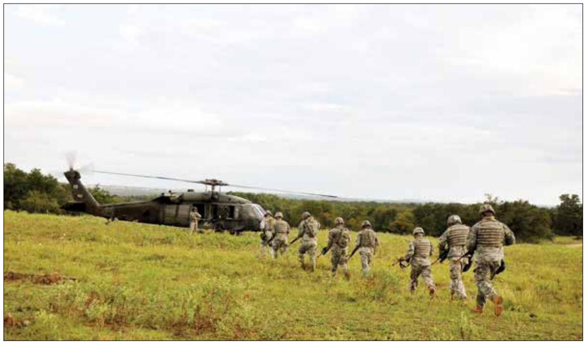
Military exercises at Fort Hood Army Base, Texas.

Habitat Exchange is really very simple. Energy companies and other developers would come to the exchange and say, "Hey, I'm going to impact 100 acres of habitat, I need to buy land improvement credits to make up for that damage." The Habitat Exchange would quantify the area—and the quality of the habitat. Farmers and ranchers would then sell credits generated by improving or preserving habitat on their lands. They'd sell those mitigation services just like they would any other agricultural commodity.